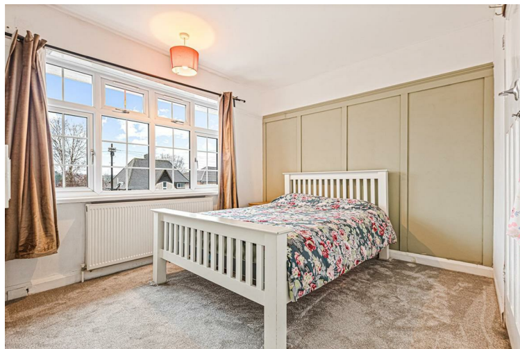
BEDROOM THREE 12'0" x 9'6" (3.67 x 2.91) Built in cupboard, radiator, double glazed window to front aspect.