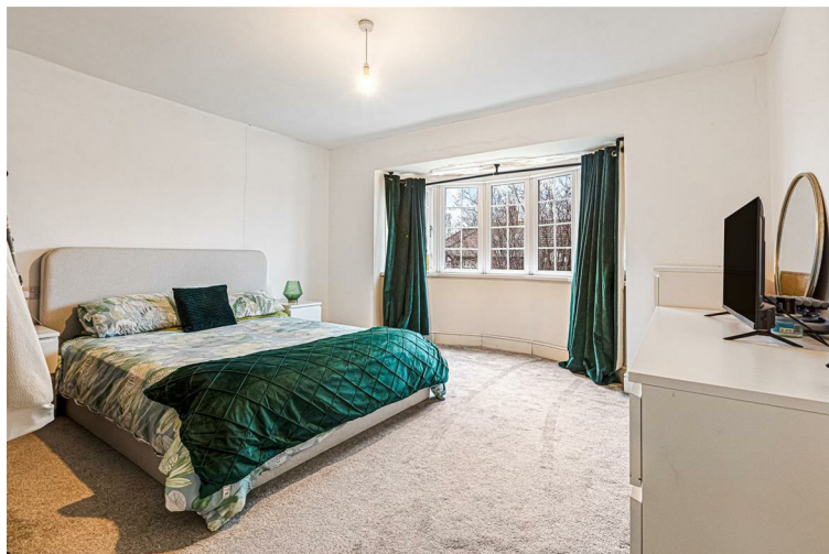
BEDROOM ONE 14'10" to bay x 13'11" (4.54 to bay x 4.26) Radiator, double glazed window to front aspect.