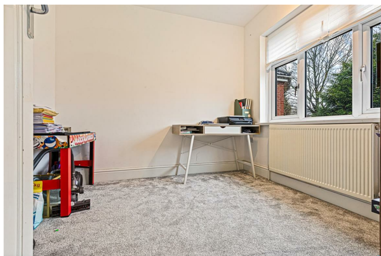
BEDROOM FOUR 8'11" x 8'1" (2.74 x 2.47) Radiator, double glazed window to rear aspect.