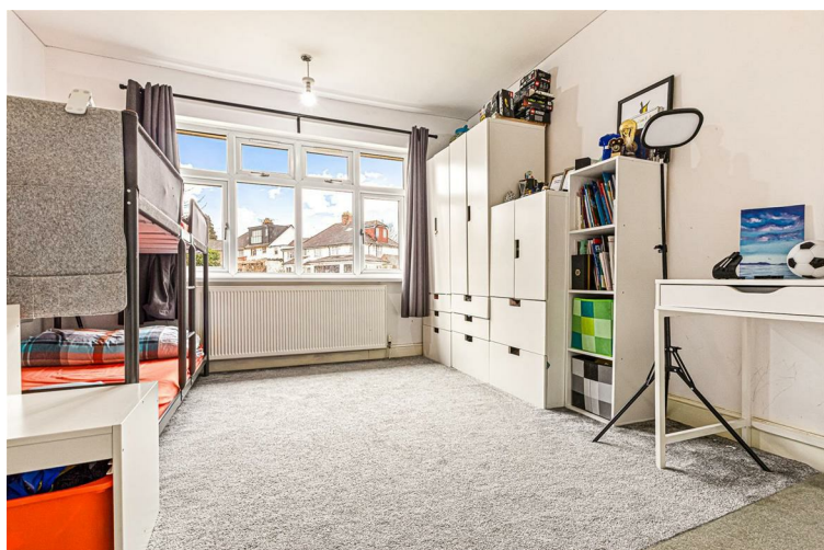
BEDROOM TWO 12'11" x 11'5" (3.95 x 3.49) Radiator, double glazed window to rear aspect.